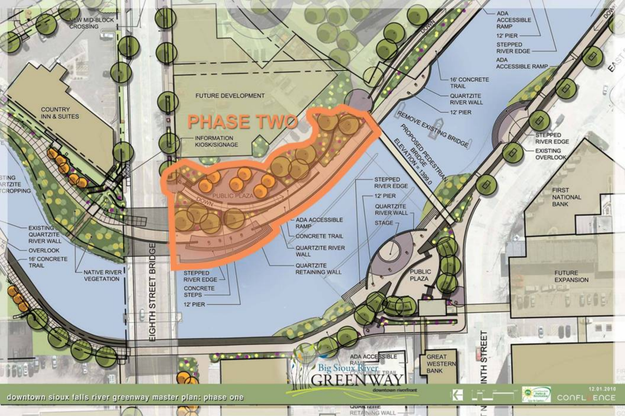
Downtown Sioux Falls River Greenway: Phase Two Project Area